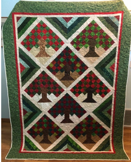
Ohlone College Foundation Gala Auction Item