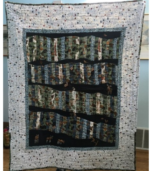
Ohlone College Foundation Golf Tournament Auction Item