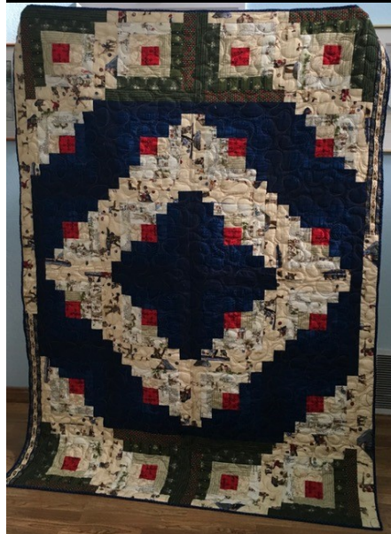
San Francisco Region Boy Scouts